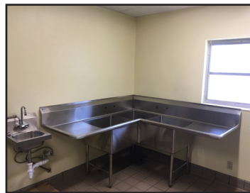
Hand-washing sink alongside the three-compartment kitchen sink for washing large cookware.