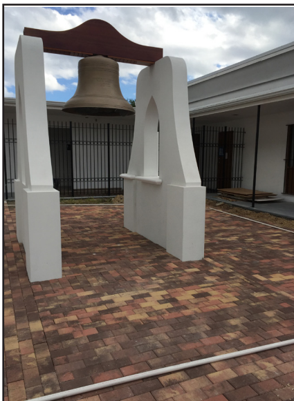
Bell Tower and Brick Pavers