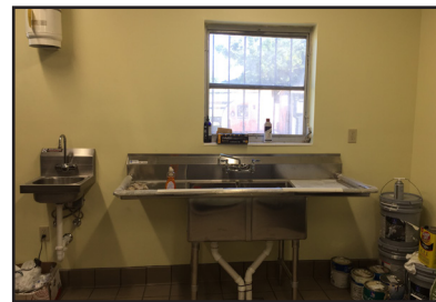
Hand-washing sink alongside two-compartment food-prep sink with "run out" directly to sewage pipeline.