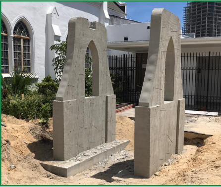
The Bell Tower to house the renovated bell.