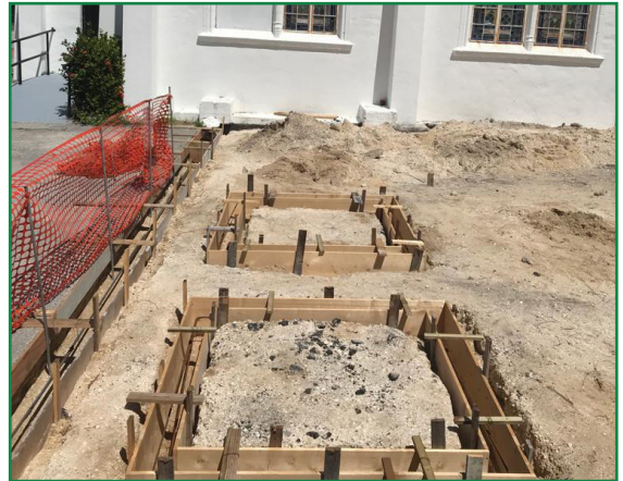
Two palm tree planters. The location is where the parking area was in front of the Parish Hall.