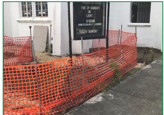
The fencing has been removed and will be replaced.