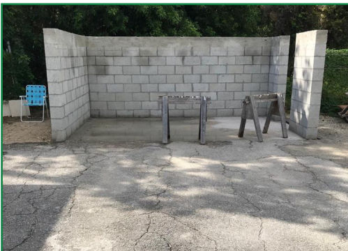
Structure to house refuse containers